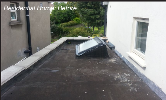
Residential Home: Before