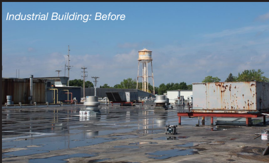
Industrial Building: Before