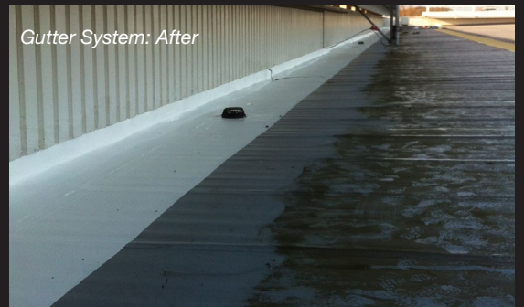
Gutter System: After