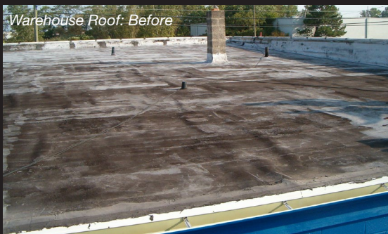
Warehouse Roof: Before