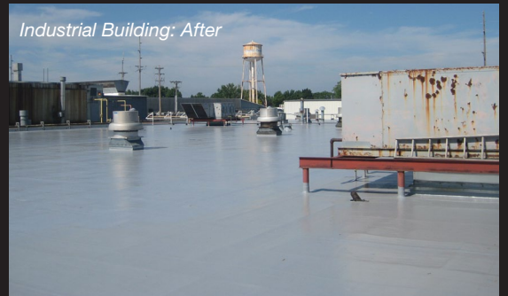
Industrial Building: After