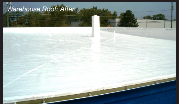
Warehouse Roof: After