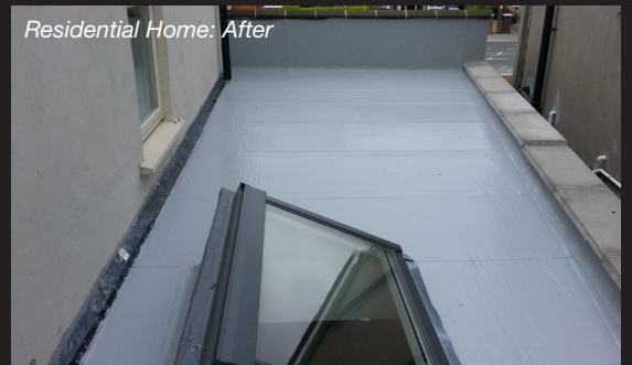
Residential Home: After